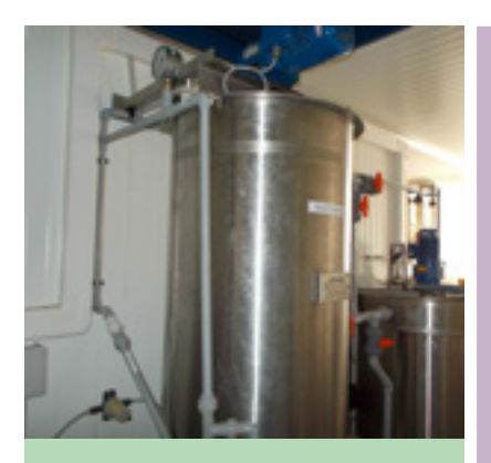
Struvia prototype reactor at the Brussels-North WWTP