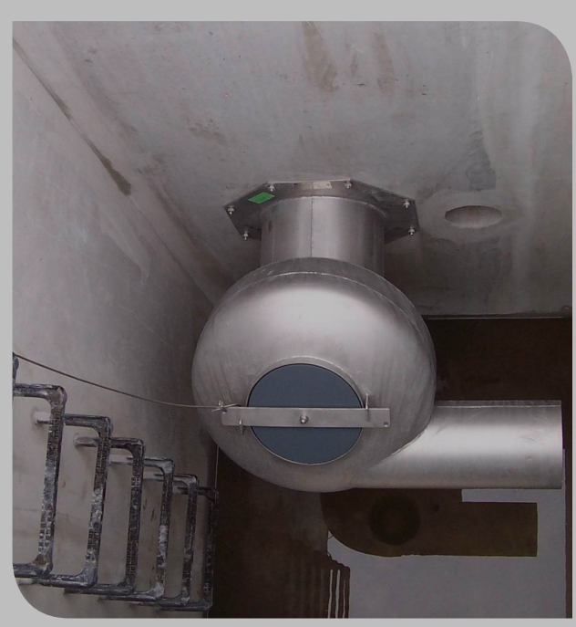
Figure 3: HYDROVEX® IHV EURO Typical Installation

If a dry chamber installation is preferred, please refer to the HYDROVEX® IHV Vortex Flow Regulator product brochure.