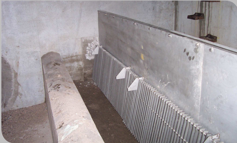
Figure 1: HYDROVEX® FluidScreen installation with floatables baffle

the fact that some sites are operated very infrequently. Finally, the use of static welded bar racks usually provides little help as the screen surface clogs very quickly during an overflow event. This can be overcome by using a large bar spacing; however the removal efficiency will be greatly reduced. The HYDROVEX® FluidScreen is a compromise solution to all these contradictory conditions.